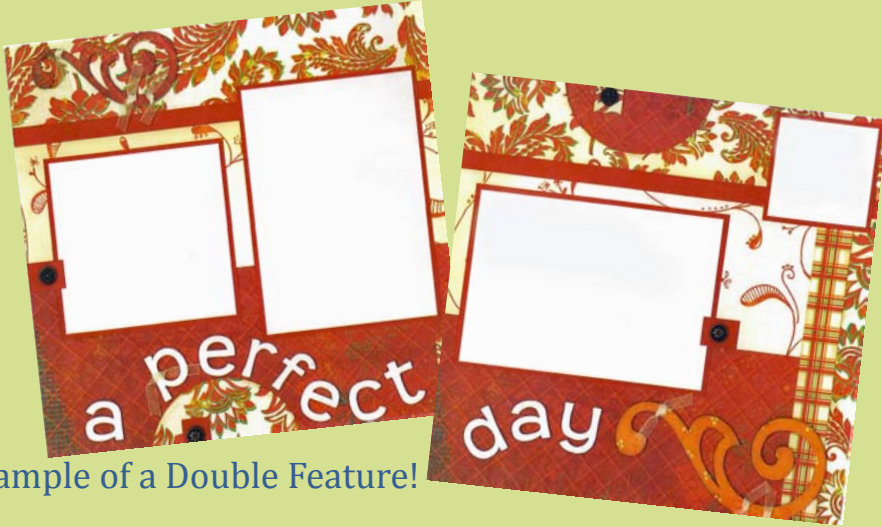
Sample of a Double Feature!